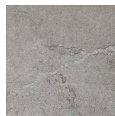
Fossil grey (COG)

For further questions, please contact info@cane-line.com or visit Cane-line.com