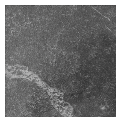
Fossil black (COB)