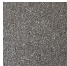
Basalt grey (CA)