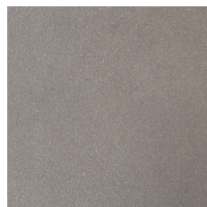
Concrete grey (CB)